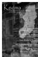
Kedma's Issue 8: Spring 2009 cover

Thanks to a generous gift from the Newton Fund , the Jewish Studies Program supports the student-led journal, Kedma: Penn's Journal on Jewish Thought, Jewish Culture, and Israel . In addition to providing funding for the journal, several JSP faculty members serve as advisors to the undergraduates who publish the journal. Kedma is embarking on its fifth year and ninth issue. Featuring a wide assortment of essays, reviews, interviews, creative pieces and more, Kedma is a forum for Penn students and faculty to discuss, debate, and challenge ideas about Judaism, Jewish society, and Israel. It seeks to bridge the political and religious spectrum by providing an open and intellectually honest forum for both Jews and non-Jews, conservatives and liberals. It also seeks to engage and excite Jews at Penn who are not normally active within the Jewish community, and to stimulate and challenge those who are. For more information, go to Kedma's website at http://www.hillel.upenn.edu/kedma/about.html , or email kedmajournal@gmail.com .