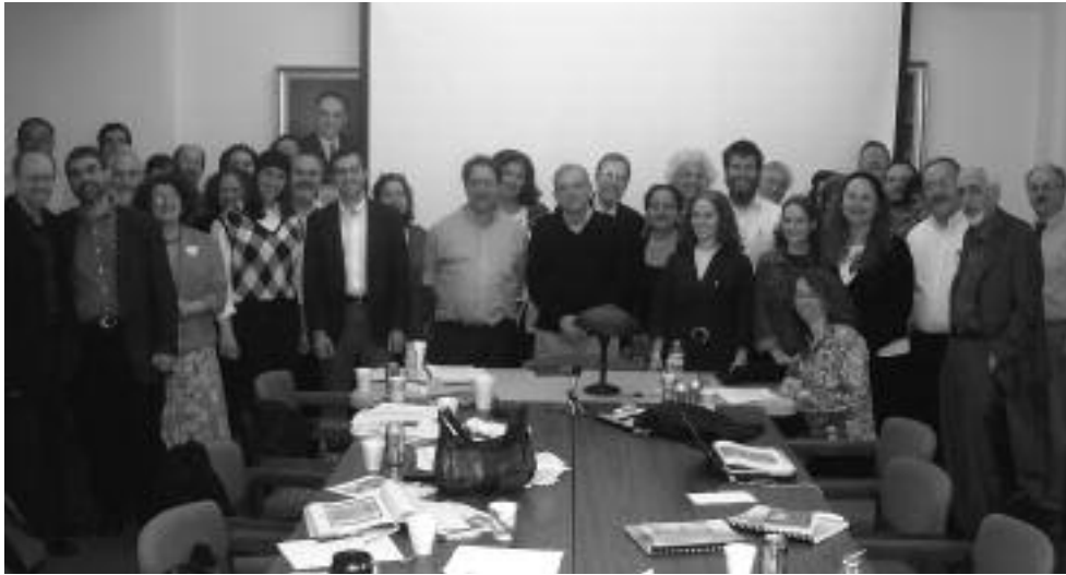
Group of librarians, faculty, and graduate students at 2009 Lehmann Workshop.