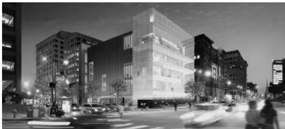
Artist's rendering of the new NMAJH building

Scheduled to open in the fall of 2010, the Museum is constructing a landmark building. With a total building size of 100,000 square feet,