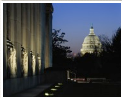
The exterior of the Folger Institute (in Washington D.C.) at night.

Accomplished scholars from a wide variety of disciplines convene at the Katz Center this year to examine the many changes in the Jewish world which characterize the early modern period. Consideration of geographical, cultural, legal, political, and economic boundaries will advance wide ranging discussions on the nature of early Jewish modernity and the early modern period in general. We hope to explore how the establishment of Jewish centers in new places affected the development of Jewish society and culture, along with the nature and characteristics of Jewish transregional networks in the early modern age. Other issues include the shifting religious and cultural borders between Ashkenazi and Sephardi Jews, and the impact of printing on cultural and intellectual boundaries inside Jewish society and between Jews and non-Jews. The Fellowship Program is enriched by two new collaborations—a partnership with Penn's Workshop in the History of Material Texts, and a spring 2014 symposium, “Jewish Books in Christian Europe,” in cooperation with the Katz Center, and the Folger Institute of the Folger Shakespeare Library in Washington D.C. Folger holdings will provide case studies for discussion. Further details will be available on our website in the fall.