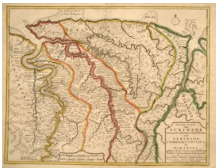
Suriname map - color view.

http://www.library.upenn.edu/exhibits/cajs/fellows13/