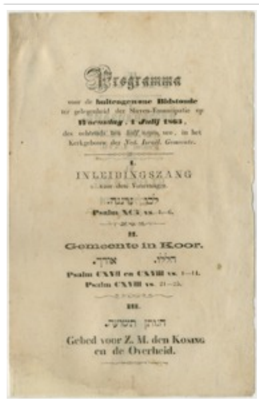
Emancipation of the Slaves, July 1, 1863. From the Suriname Collection.