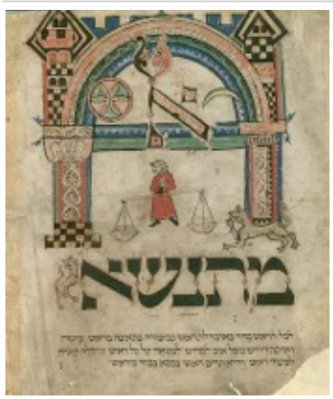
Early image of a money lender. Worms Mahzor, 13th c., Jewish National and University Library, Jerusalem. From the catalogue of the April 2013 exhibition at the Jewish Museum in Frankfurt am Main, Germany, titled " Juden. Geld. Eine Vorstellung ."