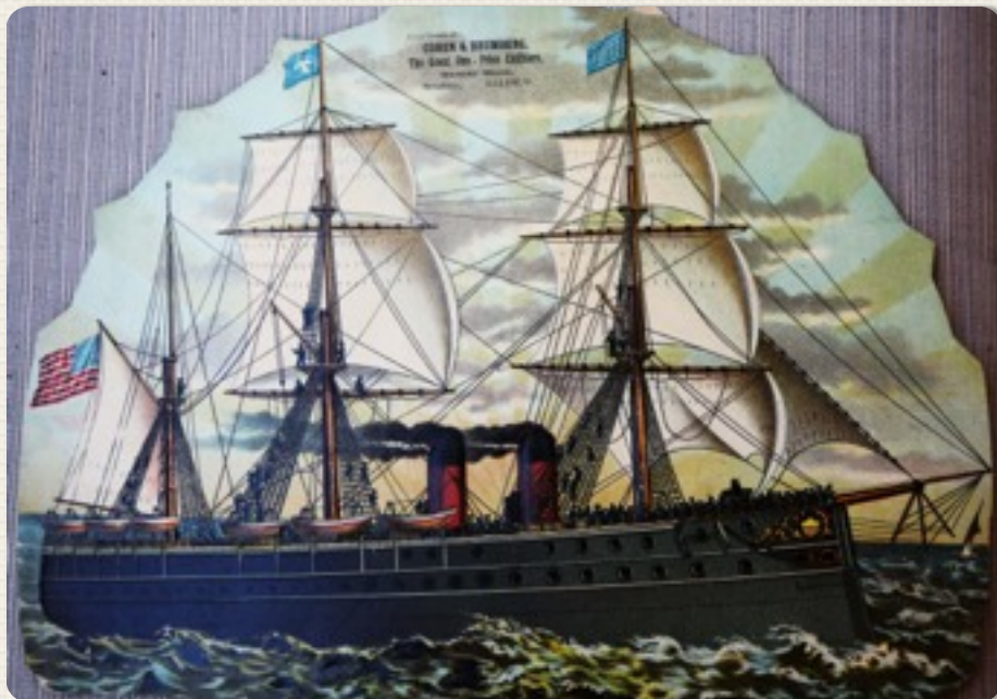
Victorian Judaica Trade Card. Large die cut lithograph of a sail/steamer ship with the American flag and raised features. Cohen & Brumberg "The Great One Price Clothier" Gurney Block. Salem, Ohio (ca. 1870s). From the Kaplan Collection at the University of Pennsylvania.

THROUGH ITS JEWISH STUDIES PROGRAM AND THE HERBERT D. KATZ CENTER FOR ADVANCED JUDAIC STUDIES, THE UNIVERSITY OF PENNSYLVANIA OFFERS AN UNPARALLELED ARRAY OF INTELLECTUAL AND EDUCATIONAL RESOURCES. ALONG WITH TEACHER-SCHOLARS, THE UNIVERSITY IS HOME TO SOME OF AMERICA'S GREATEST RESEARCH LIBRARIES IN JUDAICA AND HEBRAICA.