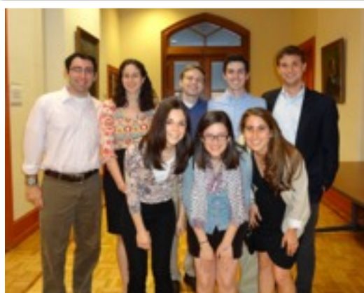
Students who presented their findings on April 24, 2013.