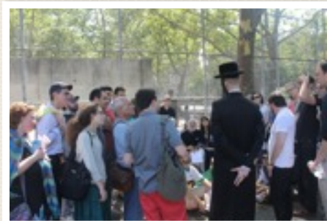
A local Hasid openly converses with the participants in the summer school about life in Williamsburg, revealing an astonishing curiosity about and familiarity with nontraditional scholarly literature. July 23, 2013.