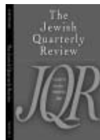
The Jewish Quarterly Review cover.