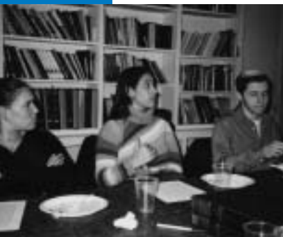
Penn undergrads digesting their thoughts.

7 students graduated in May 2003 with majors in the different Jewish Studies departmental tracks, while 1 graduated early in December 2002, and 1 graduated in Summer 2003.