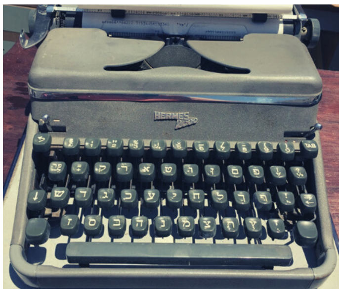
Hermes 2000 Hebrew typewriter.