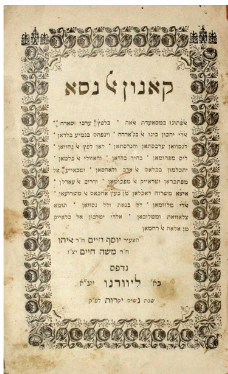
First edition of Kanun al nisa by Yosef Hayim ben Eliyahu, al-Hakam [Ben Ish Hai], published in Baghdad [printed in the style of "Livorno (typographical) letters"]: [n.p.], 1906. Text in Judeo-Arabic about Jewish laws pertaining to women. Purchased thanks to the Elis and Ruth Douer Endowment for Sephardic Studies.