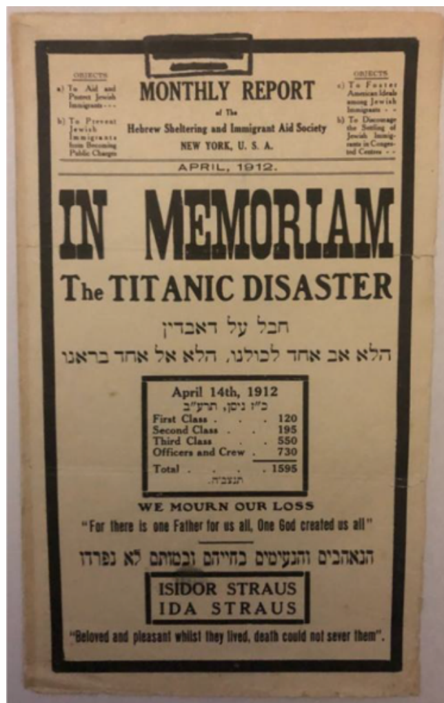
The Titanic Disaster: Hebrew Sheltering and Immigrant Aid Society Monthly Report - In Memoriam With the names of the drowned Jewish passengers. New York: April 1912, 6pp. Acquired thanks to the Busch, Goldstein-Gensler, Margolies, and Rare Judaica Endowed funds.