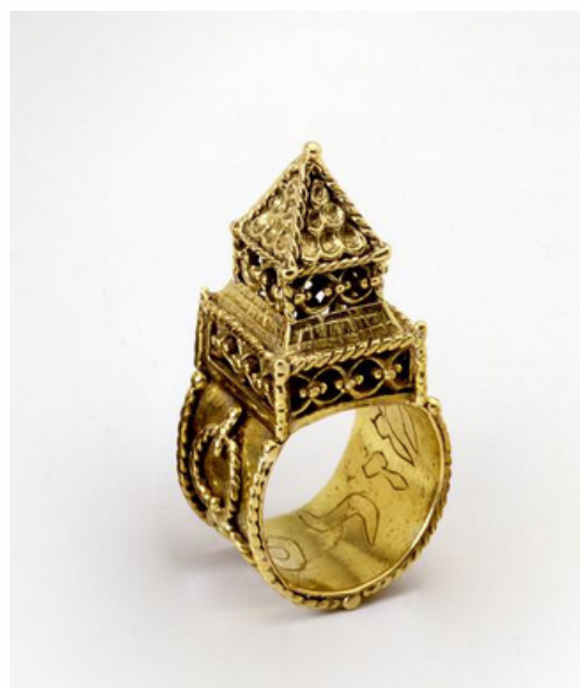
Wedding ring surmounted by a symbolic house, Italy, 17th century. Inscribed in Hebrew inside the band: "mazel tov." The Stieglitz Collection of the Israel Museum, Jerusalem.

https://www.library.upenn.edu/collections/online-exhibits/jewish-home