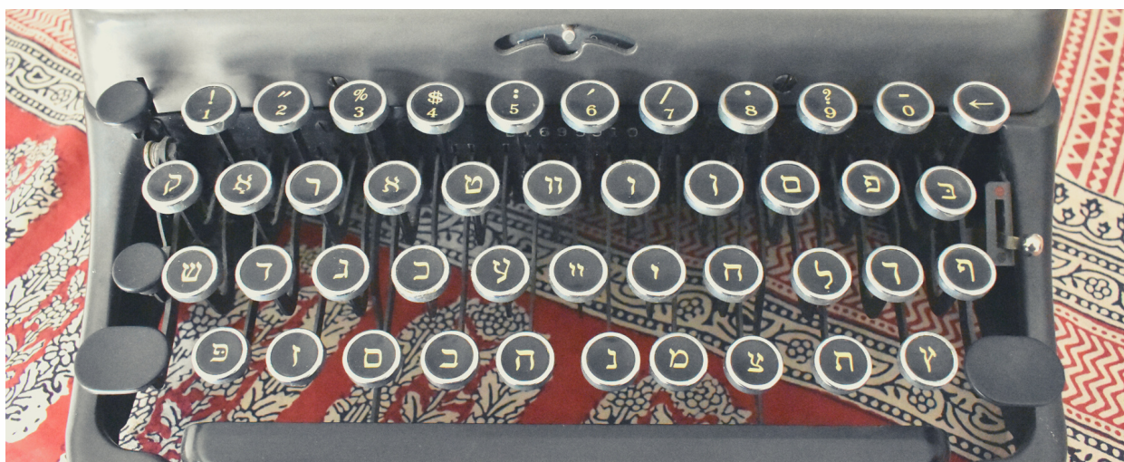
Yiddish Remington Rand typewriter.