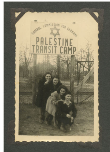
Image of four Jewish women Survivors in a Displaced Person Camp under a sign that reads "Control Commission for Germany, Palestine Transit Camp." From a personal photo album of a Holocaust survivor interned in DP Camps in Germany and Slovenia between 1946-1948 before immigrating to Israel. Purchased at Kedem Auction house, thanks to the support of the Mark S. Zucker Judaica Endowment.