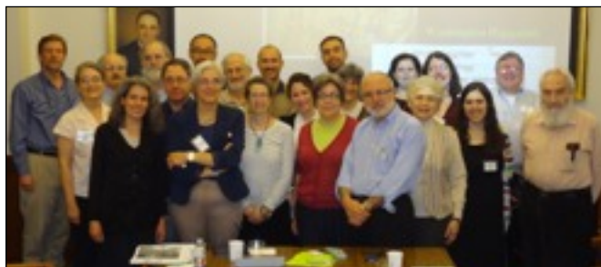
Attendees of the 2012 Lehmann Workshop on the History of the Jewish Book