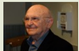
Appelfeld receiving a standing ovation